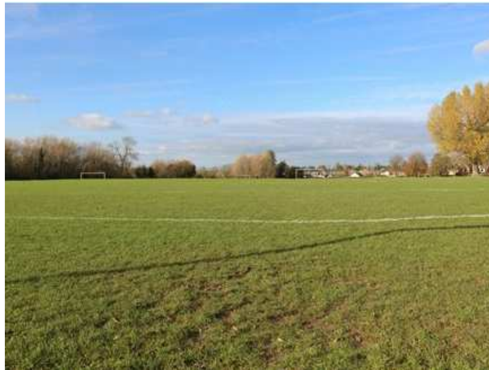
View from BMX track