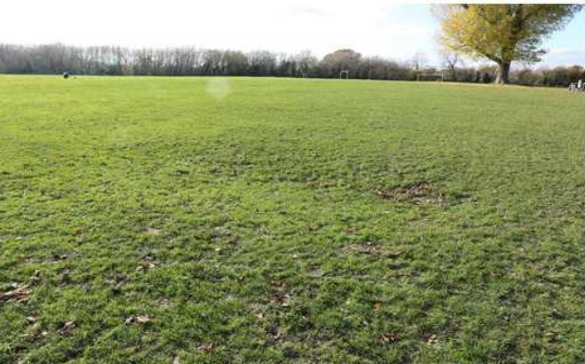
View from car park